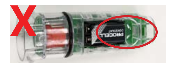
Figure 2 - TAG-200X Without Battery Retention Bracket. Do Not Use Without Battery Retention Bracket