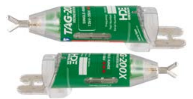
Figure 1 - HDE TAG-200X Contact Voltage Detector

This Notice Applies to All TAG-200X Contact Voltage Detectors (see, Fig. 1) Supplied with a Black Battery Retention Bracket or No Battery Retention Bracket (prior to November 15, 2023)