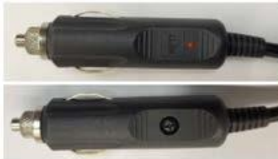
Figure 6 - Lookout Charger, updated 12V plug - not subject to safety notice

Do not use affected Lookouts and 12V Chargers units until they have been reworked by Greenlee. Contact Greenlee/HDE Technical Services at 800-435-0786 or via email at grntechnicalsupport@emerson.com to arrange for free rework and free roundtrip shipping of your affected Lookout and 12V Charger units. Thank you for your cooperation and we regret any inconvenience this may have caused you. If you are uncertain about whether your Lookouts or 12V Chargers are subject to this Safety Notice, or if you have any other questions, please contact Greenlee Technical Services as soon as possible.