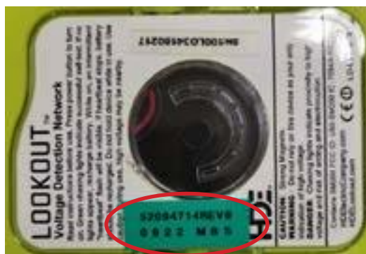
Figure 5 – Lookout Unit with green software update decal

Lookouts and 12V Chargers not subject to this Notice: If the Lookout serial number date code (Figure 2) indicates the Lookout was made after July 1, 2022 (Week 28, 2022, date code 2822 or later) or has a green software update decal shown in Figure 5, the Lookout is not subject to this notice or has already been reworked. If the 12V Charger serial number date code (Figure 4) indicates the 12V Charger was made after July 1, 2022 (Week 28, 2022, date code 2822 or later) or has the updated plug shown in Figure 6, the Charger is not subject to this safety notice or has already been reworked.