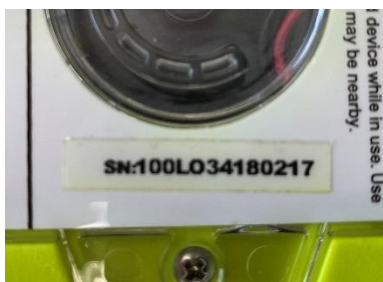
Figure 3 - Affected Lookout unit example showing serial number location. The four digits after “100LO” or “100LOOP” correspond to week and year of production, here 3418 = 34th week, 2018

Please take immediate steps to determine if you have any affected Lookouts and/or 12V Chargers in your possession. All Lookouts made before July 1, 2022 are affected. Affected Lookouts can be identified by inspecting the serial number on the back of the Lookouts. The four digits after “100LO” or “100LOOP” are the date code (Figure 3) showing week and year of production. If the four-digit date code indicates a Lookout made before July 1, 2022 (Week 27, 2022, date code 2722 or earlier), the Lookout unit is affected. Do not use an affected Lookout until it has been reworked by Greenlee/HDE.