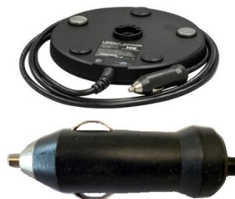
Figure 2 – Lookout 12V Charger, Cat. # LOC-01