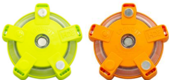
Figure 1 – Lookout Voltage Detector (yellow) Cat # LO-01 & Lookout Operator Unit (orange) Cat # LO-OP