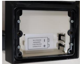
Figure 5 – Tester With Single Battery Compartment – Not Subject To Safety Notice