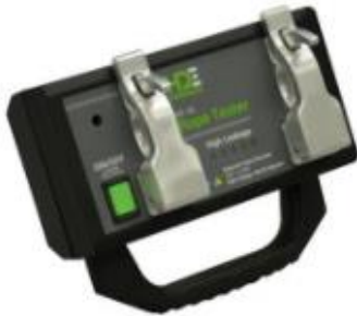
Figure 1 – RT-10 Rope Tester