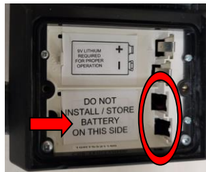
Figure 4 – Reworked Tester. Contacts Removed in One 9V Battery Compartment. Not Subject to Safety Notice.