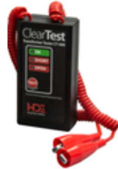
Figure 2 - CT-300 ClearTest Transformer Tester